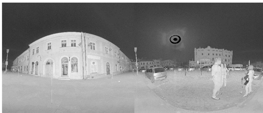
Photo 3. Single-scan point cloud in planar view mode, north-western frontage view

There are several methods for combining data obtained from laser scanner measurements. The first is to indicate planes, situational details or solids. The second method, which is more accurate, involves the use of signalled adjustment points, or reference spheres, which increase the accuracy of this method over the others. This is related to their spherical shape, thanks to which they can be recorded from different sides and directions [37].