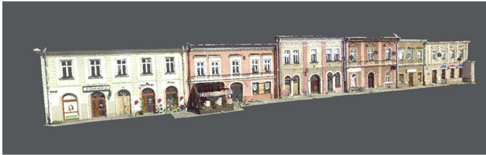
Photo 6. An example of a generated orthophoto image of the north-western frontage of the Old Market in Jarosław in Autodesk Recap 360 program; Source: own elaboration