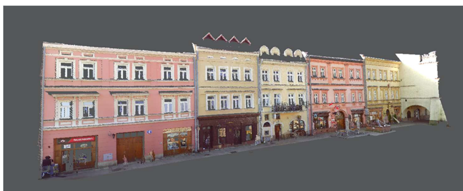
Photo 5. An example of a generated orthophoto image of the south-eastern frontage of the Old Market in Jarosław in Autodesk Recap 360 program; Source: own elaboration