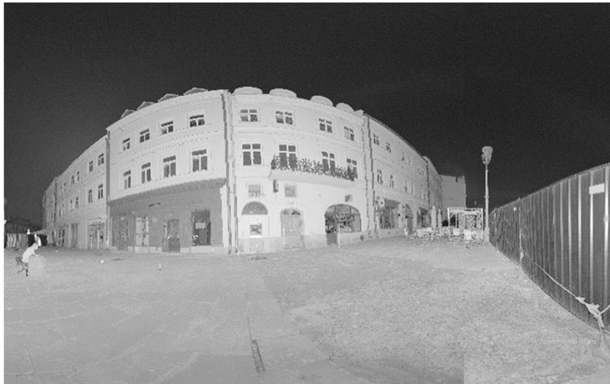
Photo 2. Single-scan point cloud in planar view mode, southeast frontage view

in the measurements. The biggest difficulties were observed in measurements of glass objects and chromium surfaces due to their ability to perpendicularly reflect the laser beam and scattering properties. The scanning of concrete and brick structures sometimes requires that the distance between the scanner and the object be reduced and more stations be spread out. The best materials, with the most favourable properties, are wood, PVC and slightly rough surfaces [15]. In the case of the buildings in Jarosław, due to their brick construction and the revitalization of the Market Square, the scanner was placed at a distance of approx. 6 -7m. The next step was to merge the data obtained from the scans into one point cloud for the whole object (photo 2, photo 3).